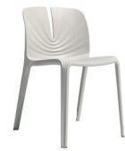
CPS10GS W19 7/8**D20 7/8**H30"