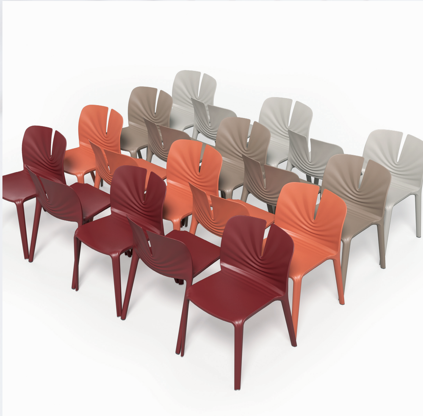
Blooming light and color