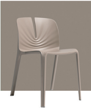
Pinkish grey (for customization)