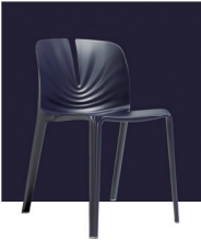
Ink blue (for customization)